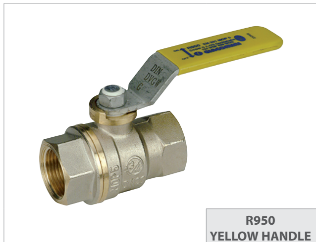
R950 YELLOW HANDLE