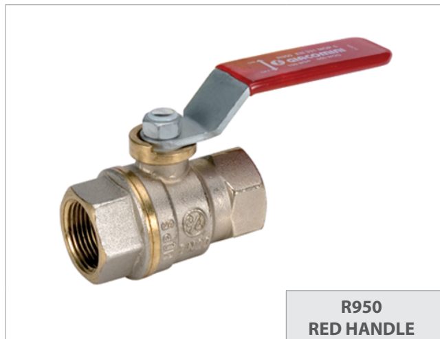
R950 RED HANDLE